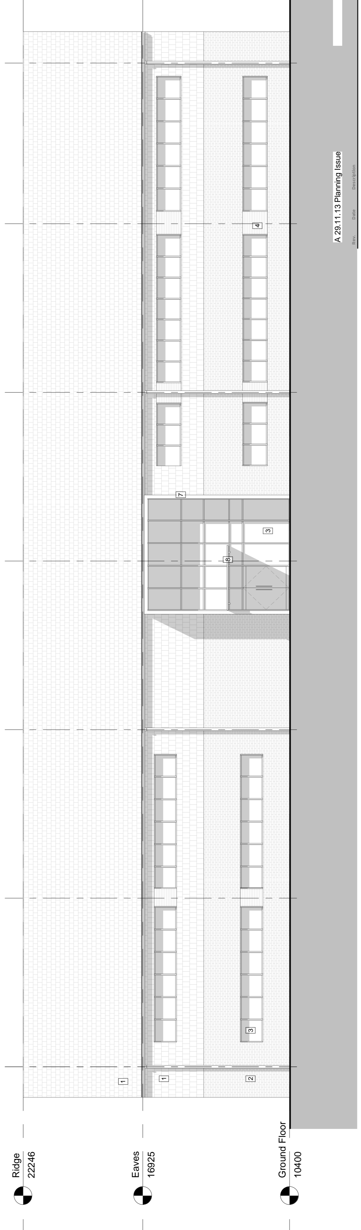
Block A West Elevation 1 : 100